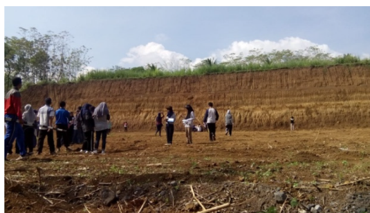
b. Identifying for possible landslides