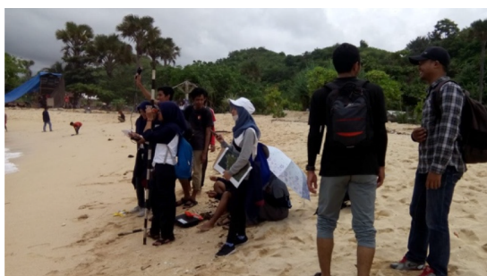
a. Identifying coastal carrying capacity