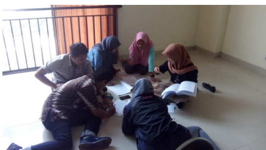
a. Discussing environmental damage

Whereas in class B, learning is carried out by applying a conventional model. In the control class, the lecturer explained the general objectives and material of the offline lecturing. At the next meeting, students made presentations and discussions following the objective in the lecturing syllabus. The detailed activities in the control group showed in the following Figure 2.