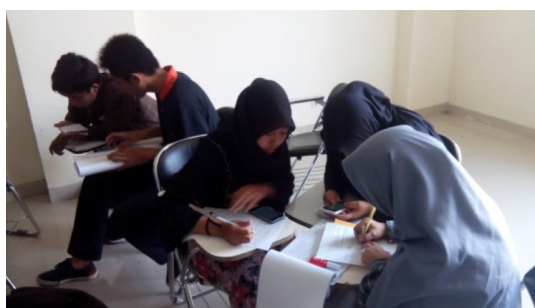
b. Designing solutions to environmental damage