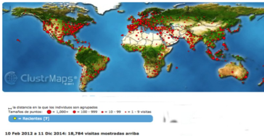
Figure 1. JOTSE readers/visitors from January 2012 to December 2014

In this first issue of the fifth year of JOTSE we would like to present an analysis of the evolution of our Journal throughout these past years. In the first place, we would like to remark the internationalization which we aimed at right at the beginning of last year. A challenge that has been accomplished as shown in Figure 1, which includes the distribution of JOTSE readers from the different continents. In this sense, it can be observed that not only there is a high density of readers in Spain but also in other European countries besides from North America and some countries in Asia.