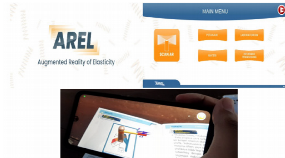
Figure 3. Application of Augmented Reality Integrated with PBL Physics Pocketbook