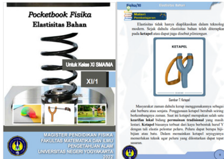
Figure 2. Design of Problem-Based Learning Physics Pocketbook Integrating Augmented Reality with Local Wisdom of Catapults