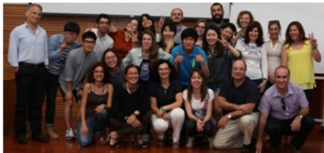
Figure 10. E4SD: The final picture

After two intensive and informal weeks of education on the thematic of sustainability, students and teachers were ready for a new adventure and took a final photo (Figure 10).