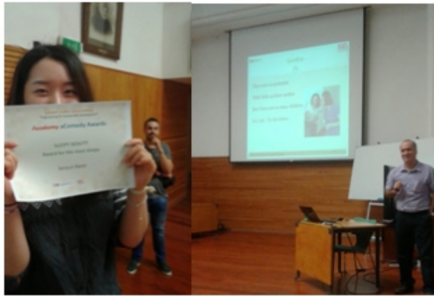
Figure 8. E4SD: Farewell session

There was the reading of a Farewell poem originally composed by one of the teachers in the organizing team of E4SD (Figure 8).