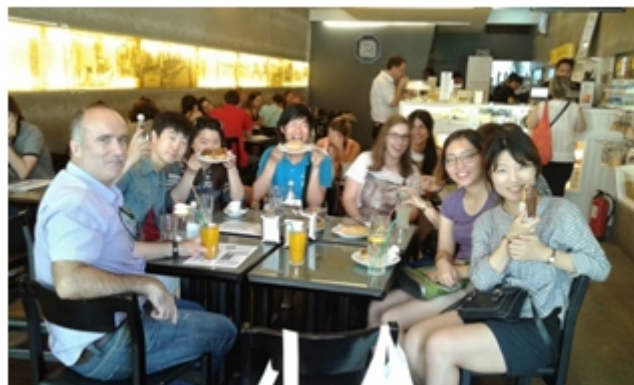
Figure 3. E4SD: Having a snack at the Leitaria da Quinta do Paço