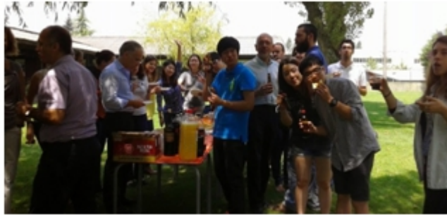
Figure 5. E4SD: Farewell picnic