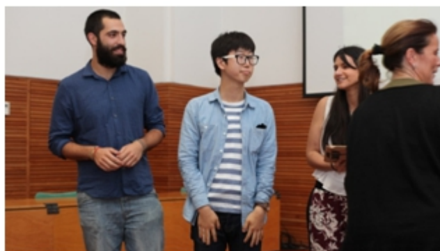
Figure 7. E4SD: Best group work award

In this session part, the Jury could also attribute the prize for the Best Group Work to Group nº 1 that was composed by only one Korean (as the other student had to return back home one week sooner due to health condition) and two Portuguese students (Figure 7).