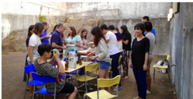
Figure 4. E4SD: Korean dinner in the students residence

As recognition of this informal environment and showing the change of attitude towards the teachers, the Korean students have decided to invite all their Portuguese colleagues as well as Professors to try a little taste of Korean food, cooked by themselves in their own residence. The result (shown in Figure 4) was a very nice evening, with very nice Korean food being served in the backyard of the students' residence, lots of fun and party.