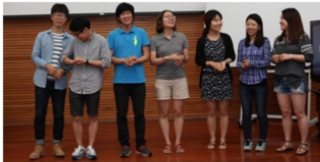
Figure 9. E4SD: A spontaneous expression of emotions

Finally the Korean students spontaneously decided to perform a Korean song dedicated to all the E4SD participants (Figure 9), in a very emotional session.