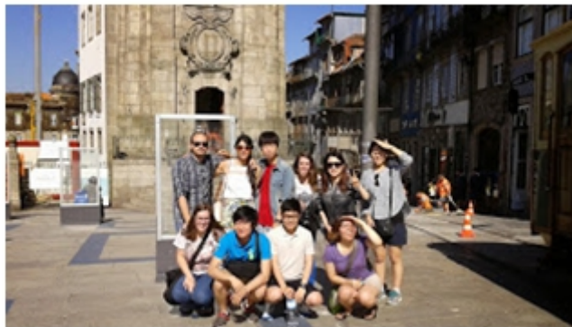
Figure 2. E4SD: Short break in front of the Clérigos Tower

After this, everyone was allowed to go back home and to rest on their own.