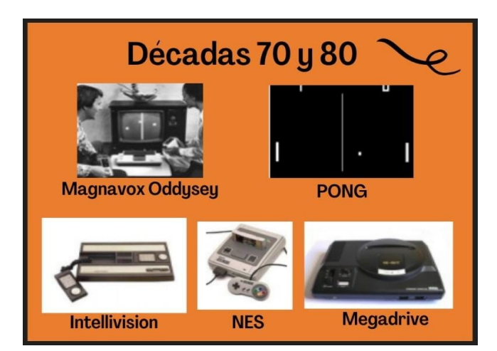
Figure 3. The 1970s and 1980s