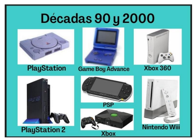
Figure 4. The 1990s and 2000s

This decade is marked by the influx and notable impact of home consoles. As Levis (2013) notes, 'in the early 1990s, arcade attendance was affected by the explosion of the home video game market and the economic downturn' (p. 146). To make matters worse, arcade games were becoming increasingly expensive to produce and maintain, which meant difficulties for video game arcades in retaining their audiences. Video game consoles took a major technical leap forward with the so-called '16-bit generation', which included the Mega Drive, Nintendo's Super Famicom (renamed the Super Nintendo Entertainment System or Super NES in the West) and Capcom's CPS Changer (Belli & López, 2008). In the mid-1990s, in 1994, the American rating system known as the Entertainment Software Rating Board (ESRB) was introduced. However, with the exception of the UK and Germany, no country in the European Union had put in place mechanisms to regulate the content of home video games (Levis, 2013). By the end of the decade, the most popular console was the Playstation (Figure 4), with titles such as Final Fantasy VII (Square), Resident Evil (Capcom), Gran Turismo (Polyphony Digital) and so on (Belli & López, 2008).