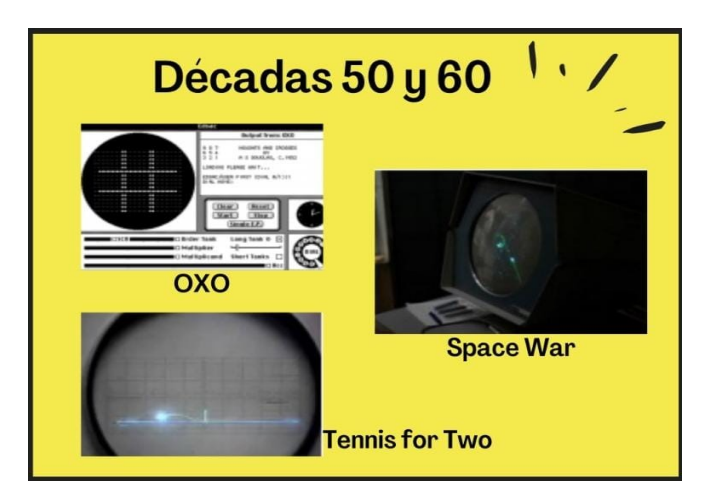
Figure 2. The 1950s and 1960s