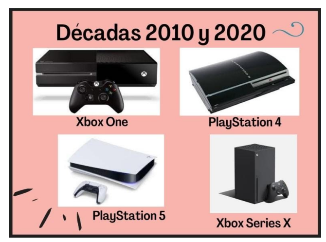
Figure 5. The 2010s and 2020s.

This decade was a time of great change and progress in the video game industry, laying the groundwork for the developments that would follow in the 2020s. In particular, the rise in popularity of streaming platforms such as Twitch and YouTube has transformed the way gamers interact with video games. These platforms allow gamers to livestream their games and share their gaming experiences with a global audience. One of the outstanding trends of the 2010s was the boom in indie games. Platforms such as Steam have made it easier for independent and indie game developers to create and distribute their games without having to rely on major companies. However, 2010 also saw the release of some very commercially successful games, such as Grand Theft Auto 5 and God of War. This success can be attributed to the launch of several new game consoles, such as the PlayStation 4, Xbox One and Nintendo Switch (Figure 5). Similarly, when it comes to mobile and tablet gaming, the decade's standout titles in terms of popularity are Angry Birds and Candy Crush Saga, both of which were launched onto the market in 2012.